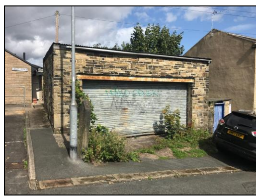
Bottomley Street Garage