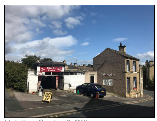
Valeting Centre & Office

214.62m<sup>2</sup> (2,310 sq ft) Site Area 445m<sup>2</sup> (0.11 acres) approx.