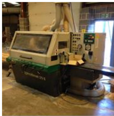
Weinig Profimat 23E Moulder Planer