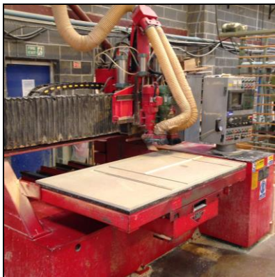
Rye CNC Routing Machine